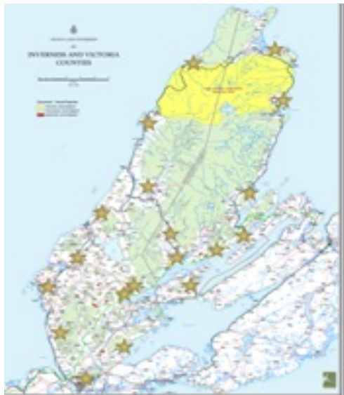
Raising the Villages Communities in Western Cape Breton Island

The geographic area and unique cultural diversity being served is extensive from Meat Cove to Port Hawkesbury, with a population of approximately 26,000 representing Gaelic, Acadian, Mi'kmaq and others across a largely rural region.