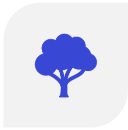
LOW CARBON SCENARIO