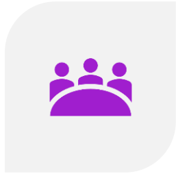
MUNICIPAL ENERGY LEARNING TEAM