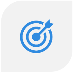
TARGET SETTING & ACTION PLAN