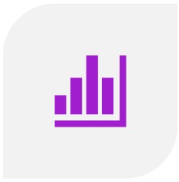
DATA COLLECTION – GHG INVENTORY