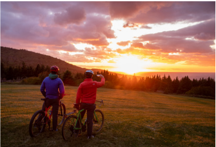
Biking at sunset