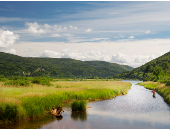
Fly Fishing, Margaree River

Belle Côte is situated on the historic mouth of the Margaree River on the Cabot Trail. Its rugged and sprawling ocean views offer some of the best sightseeing on the island.