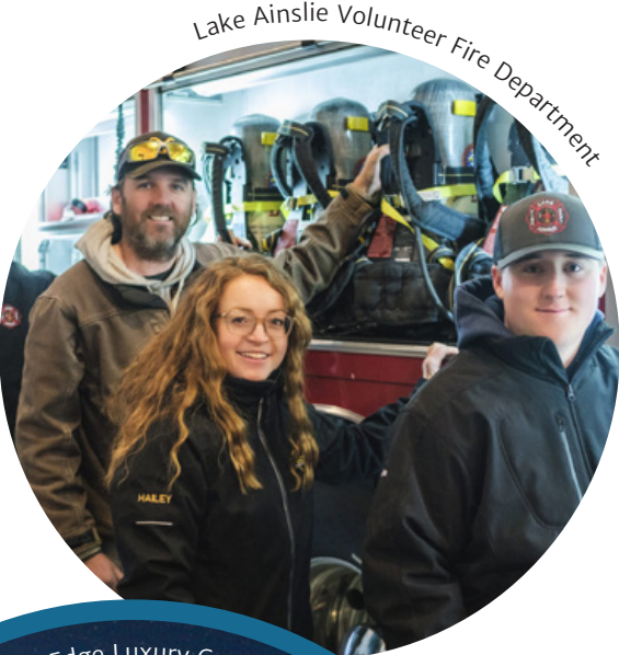
Lake Ainslie Volunteer Fire Department