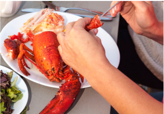
Lobster fresh off the dock