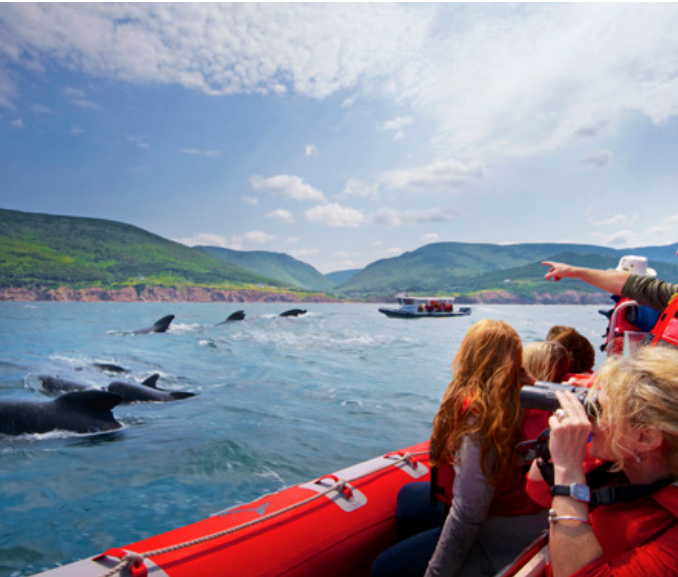
Whale watching, Pleasant Bay

Pleasant Bay lies on the shore of the Gulf of St. Lawrence in Northern Cape Breton. Known as the whale watching capital of Cape Breton, this community marks the centre of the Cabot Trail. Highlights of the region include the Whale Interpretive Centre and MacIntosh Brook Trail.