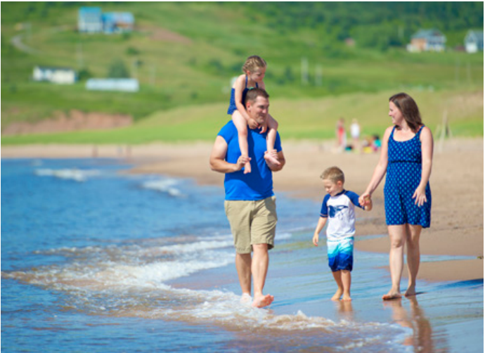
West Mabou Beach