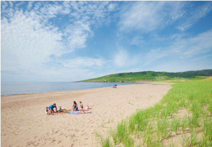
West Mabou Beach

Home of Canadian music legends, the Rankin family, Mabou is a picturesque community steeped in Gaelic tradition. The Red Shoe Pub, local art and craft shops, and retail services are complemented by rolling green farmlands and the spectacular backdrop of Mabou Harbour.