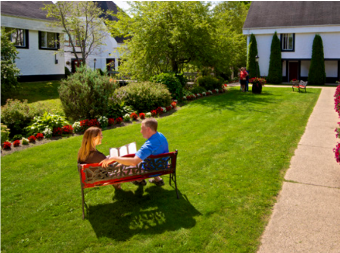
Glenora Inn & Distillery

There are a growing number of employer and municipal-led housing initiatives to help newcomers find temporary housing while they search for their dream property.