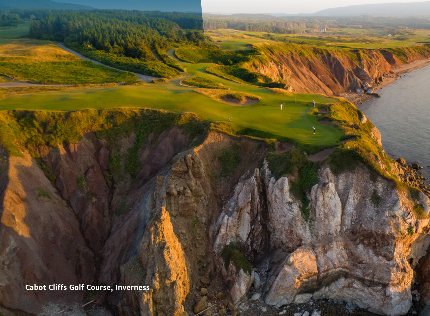
Cabot Cliffs Golf Course, Inverness

The Municipality of Inverness County is located in Unama'ki (Cape Breton). Unama'ki means 'land of fog' and is one of the seven districts of Mi'kma'ki, the traditional and unceded territories of the Mi'kmaq. We honour and respect the Mi'kmaq people who have stewarded this land since time immemorial and recognize the ongoing relationships and responsibilities to these lands. We also acknowledge that people of African descent have been in Nova Scotia for over 400 years, and we honour and offer gratitude to those ancestors of African descent who came before us to this land.