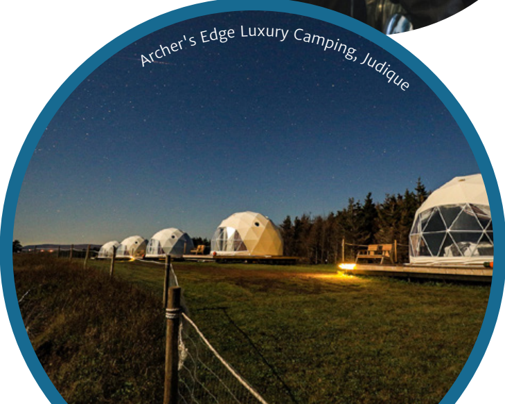
Archer's Edge Luxury Camping, Judique