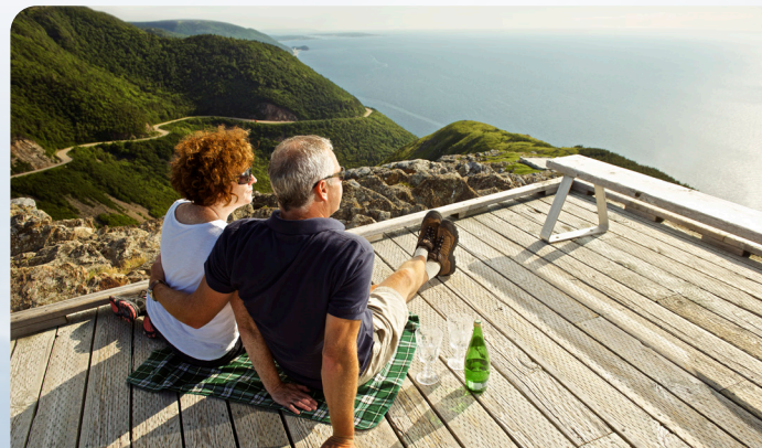
Skyline Trail, Cape Breton Highlands National Park