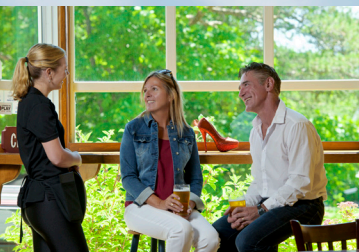
Red Shoe Pub, Mabou

Discovering the possibilities and opportunities of a new place to live, work and play can be the most exciting adventure. Inverness County, situated on the scenic western coast of Cape Breton Island, Nova Scotia, is waiting for you. We invite you to experience your healthcare career here in new and extraordinary ways.