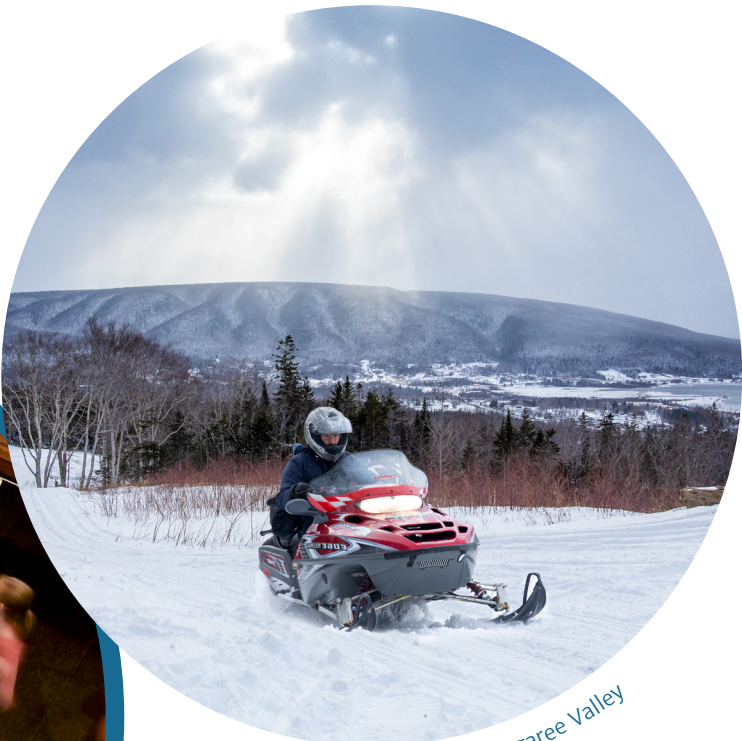
Snowmobiling, Margaree Valley