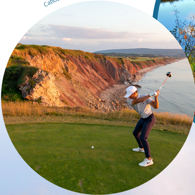
Cabot Cliffs Golf Course, Inverness