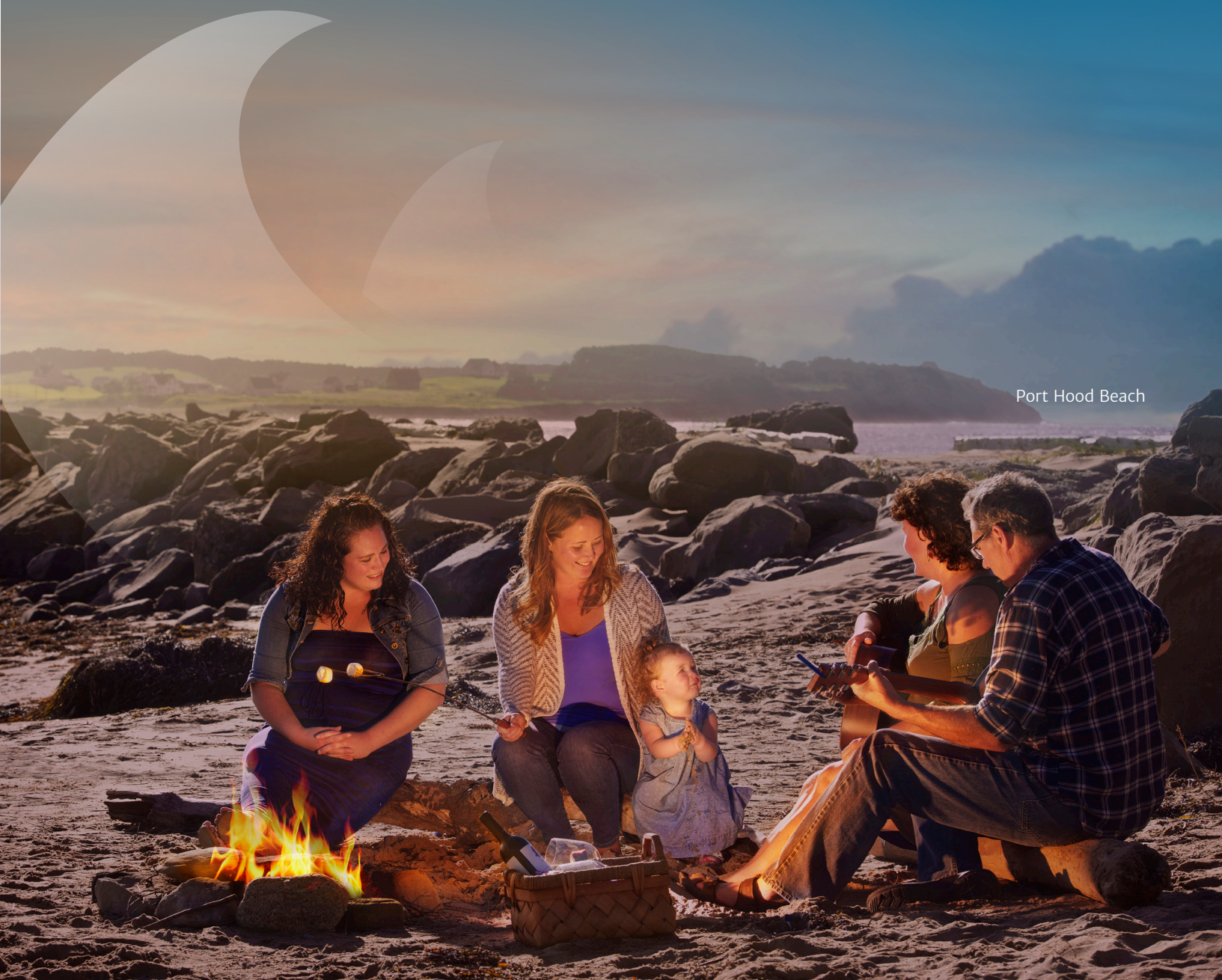
Port Hood Beach