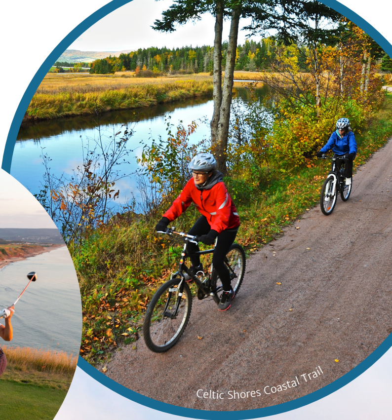
Celtic Shores Coastal Trail