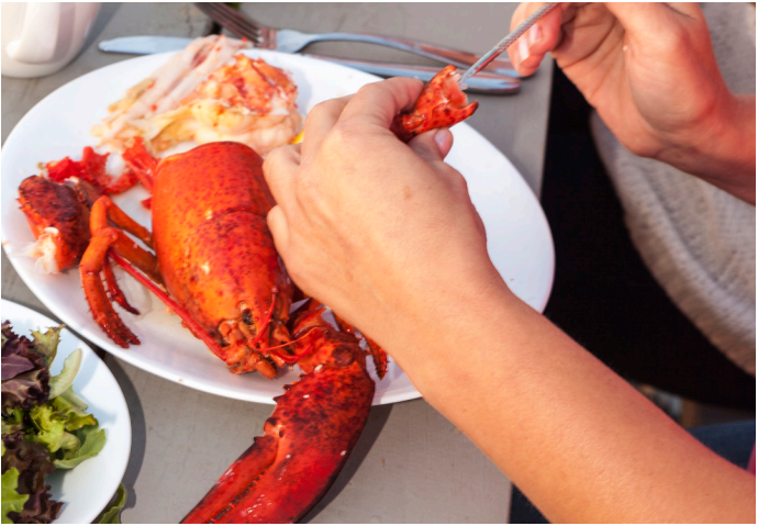
Lobster fresh off the dock