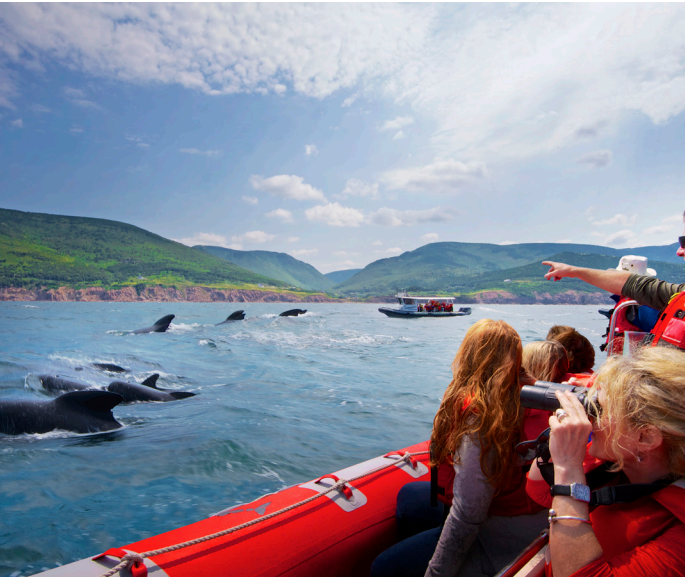
Whale watching, Pleasant Bay

Pleasant Bay lies on the shore of the Gulf of St. Lawrence in Northern Cape Breton. Known as the whale watching capital of Cape Breton, this community marks the centre of the Cabot Trail. Highlights of the region include the Whale Interpretive Centre and MacIntosh Brook Trail.