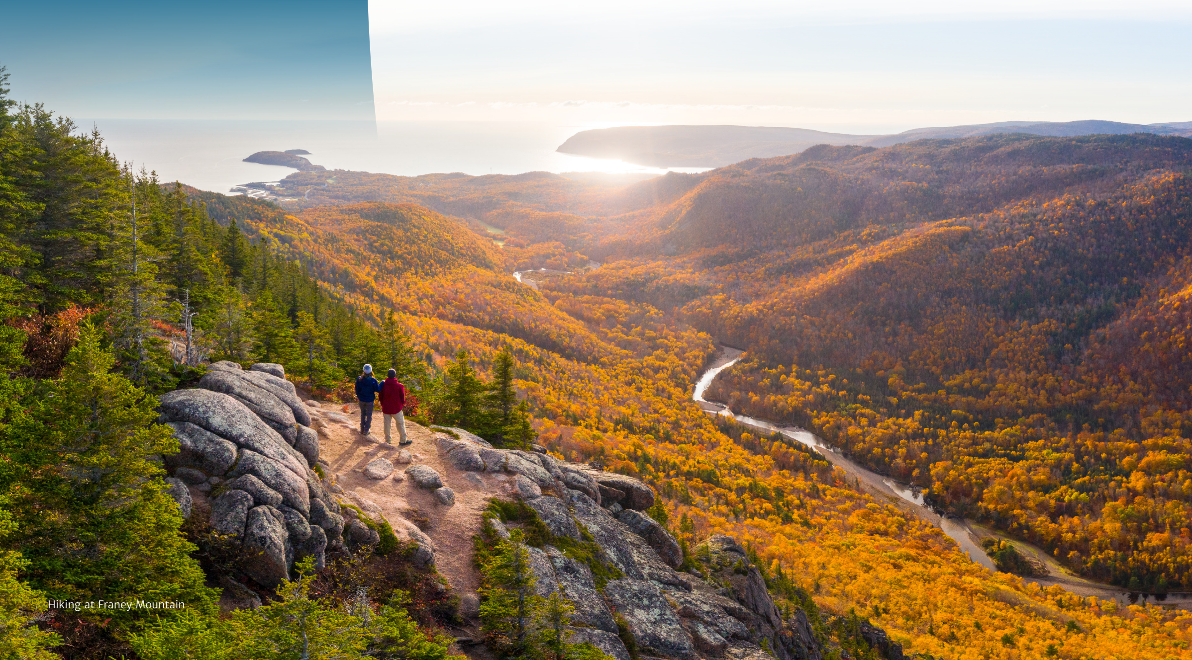
Hiking at Franey Mountain