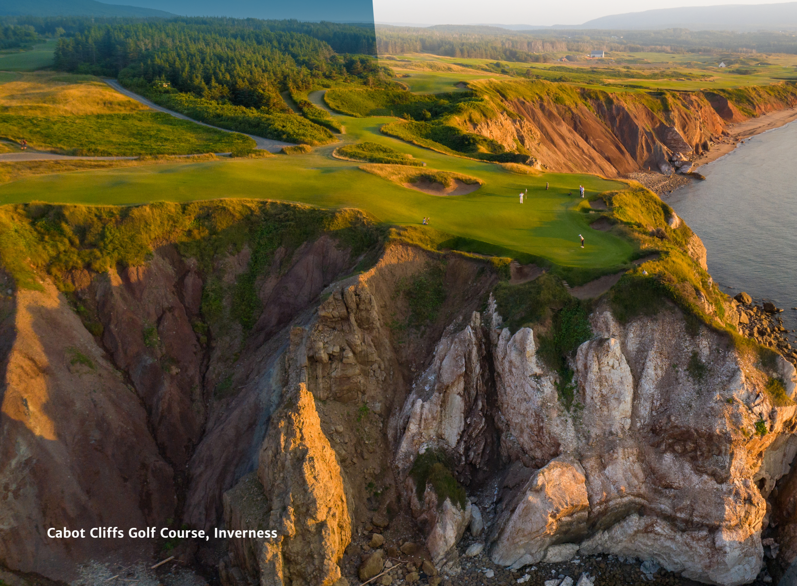
Cabot Cliffs Golf Course, Inverness

We honour and respect the Mi'kmaq people who have stewarded this land since time immemorial and recognize the ongoing relationships and responsibilities to these lands.