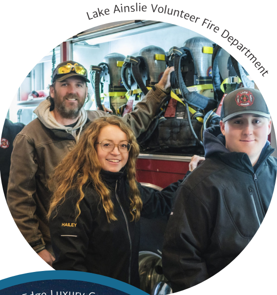
Lake Ainslie Volunteer Fire Department