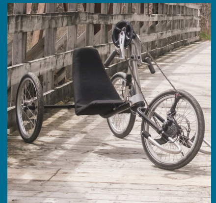
Varna II Handcycle