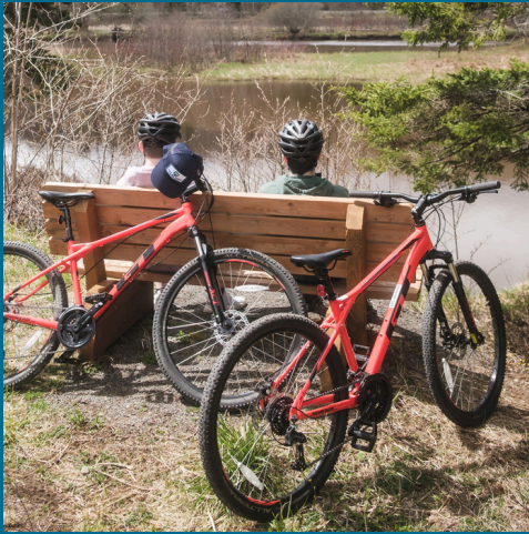
GT Off-Road Bike